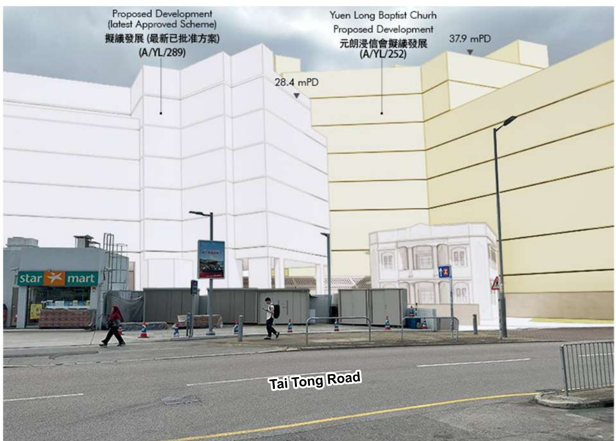
Approved Scheme (A/YL/289)